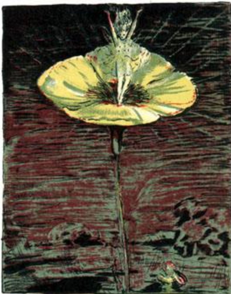
The Fairy Flower

"You were Real to the Boy," the Fairy said, "because he loved you. Now you shall be Real to every one."